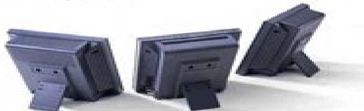
Easel-styled supports allow SoundSpace 5 to be angled when free standing. Keyholes are provided on each unit for wall-mounting.

The remarkable SoundSpace 5 system delivers stereo reproduction that rivals the concert-hall quality of full-sized Nakamichi components. Its three units, styled in contemporary brushed metal and acrylic, are designed to be arranged in a variety of ways - standing, tilted like easel frames, or even hung on the wall. Charcoal, blue or green speaker grilles are included for coordination with any room decor.