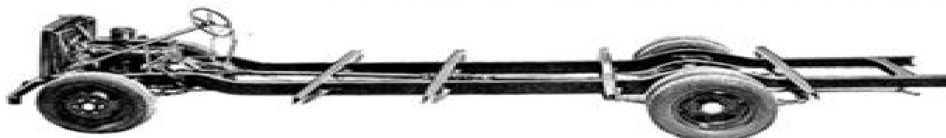
Fahrgestell 3,6—47 in Wirtschaft- oder Wehrmachtausführung

Das Bild zeigt das Fahrgestell 3,6—36. Das Fahrgestell 3,6—42 hat längeren Rahmen und größeren Radstand.