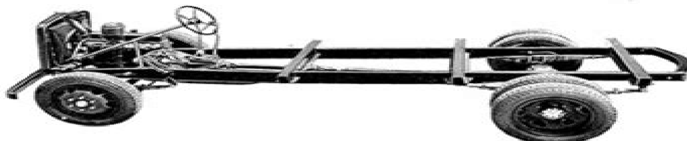
Fahrgestell 3,6—36 in Wirtschaft- oder Wehrmachtausführung