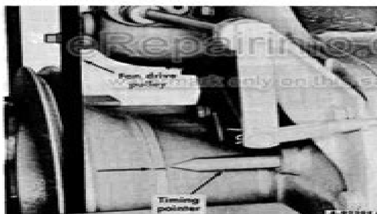
Illustr. 24B Notch on the fan drive pulley and the timing pointer.

If the spark plug cables have been removed for any reason, attach the cables to the spark plugs and to the terminal sockets of the distributor cap in the following order: The No. 1 cylinder spark plug cable to the socket marked "1" in Illustr. 24 and 24A. Then, going around the distributor cap in a clockwise direction, attach the cable from the No. 3 spark plug to the next or second socket, the cable from the No. 4 spark plug to the next or third socket, and the cable from the No. 2 spark plug to the fourth or last socket. Assemble the secondary cable "A" in the distributor cap. See Illustr. 24 and 24A.