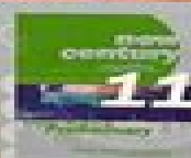
New Century Maths 11 General Workbook Preliminary ISBN 978 0 17 033007 8