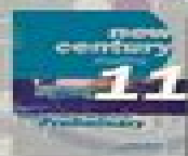
New Century Maths 11 Mathematics Workbook Preliminary ISBN 978 0 17 033045 5