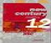
New Century Maths 12 Mathematics Workbook HSC ISBN 978 0 17 033046 2