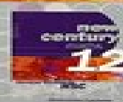
New Century Maths 12 General Workbook HSC ISBN 978 0 17 033008 5