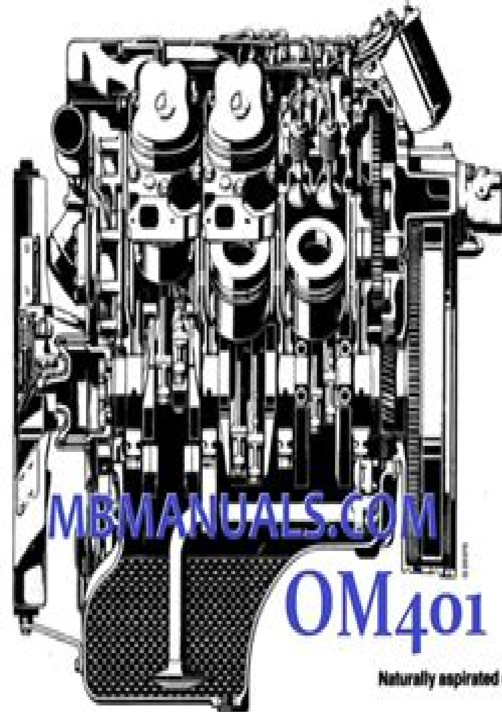
Naturally aspirated engine OM 401