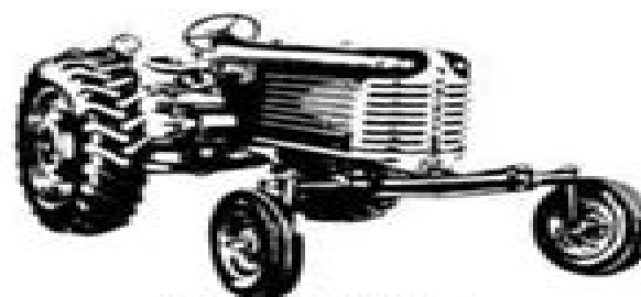
ROW CROP FOUR WHEEL ADJUSTABLE TREAD