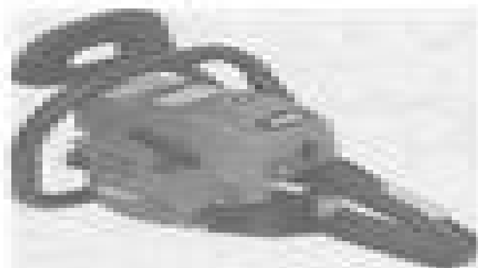
300C, 800C Chrysler