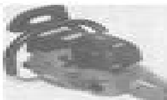
300C, 800C Chrysler