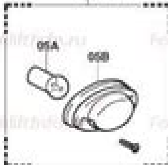
05(LPG, STEEL CABIN)