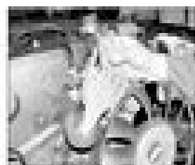
4.70b ... and remove the fan unit