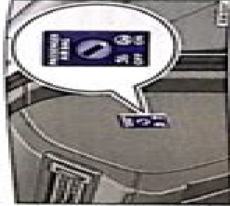
Fig. 17 In the dash panel on the front passenger side, key-operated switch for switching the front passenger front airbag on and off.

⚠ Please refer to Δ at the start of the chapter on page 18.