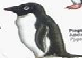
Pingüino de Adelia Adelia Penguin Pygoscelis adeliae / 40