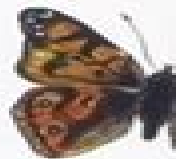
Dama Patagónica Patagonian Lady Vanessa tenax 6 cm