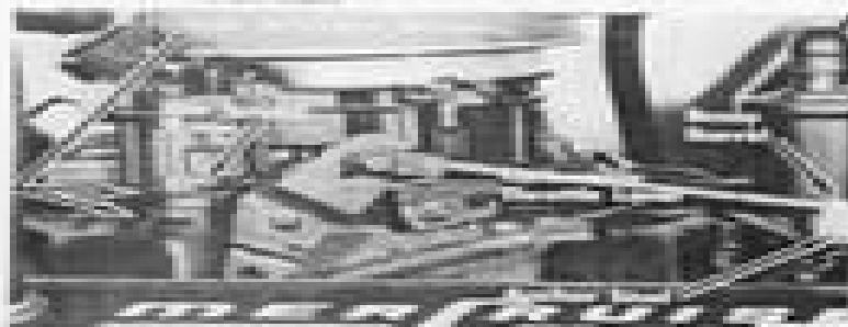
Figure 5. Idle Adjustment - McCroskey 225-250-325