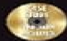
Image shown is of the core product; image of product received may appear differently.