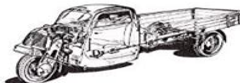
Fig. 113 Voorwielaandrijving met ketting

Bij trekkers wordt de motor voorin geplaatst, terwijl de aandrijving via de achterwielen plaatsvindt. Fig. 114 toont deze aandrijving, waarbij de motor van staande cilinders is voorzien. Deze kan echter ook met liggende cilinders worden uitgevoerd.