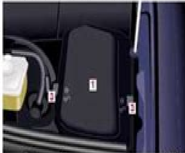
1 - Fuse box in engine compartment, left-hand side 3 - Tabs