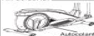
Autocolant număr de serie

Sortați numărul de serie în spațiul de mai sus, pentru referință.