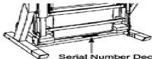
Serial Number Decal

Find the serial number in the location shown below. Write the serial number in the space above for reference.