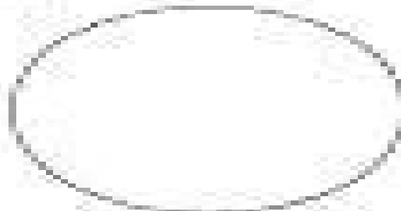
Observe Root Cross Section