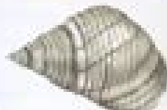
Marsh Periwinkle (CB,V)

Olivella septentrionalis To 2.5 in. (6 cm) Glossy, yellow to grayish cylindrical shell has markings that resemble lettering. South Carolina's state shell.