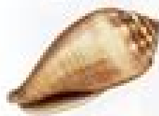
California Cone (CAS)

Alia carinata To 3 in. (7.5 cm) high Small shell has a pointed apex. Inside is pinkish white. Common in shallow water.