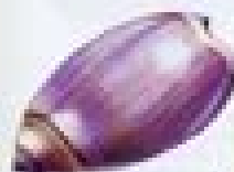
Purple Dwarf Olive (W)

Euryspira angulata To 1 in. (2.5 cm) high Shell has 8-10 deep, blade-like ribs.