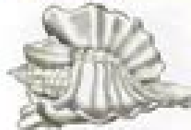
Foliate Thornmouth (W)

Cerithium foliatum To 1.5 in. (4 cm) high Shell has three large, leaf-like flanges. Color varies from white to dark brown depending on location.