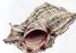
Apple Murex (CB)

Chamaelea lamarckii To 2 in. (5 cm) Elaborate pinkish-white to brownish shell with long flaps.