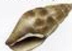
Carinate Downsail (W)

Chamaelea pumila To 4.5 in. (11 cm) Yellow-white to brownish shell has raised ribs but lacks long spines. Note brown spots on outer lip of shell.