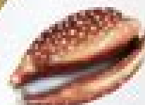
Atlantic Deer Cowrie (CB,CB)

Littorina littorea To 1 in. (2 cm) Gray to brown rounded shell has a low spine and low spiral ridges. Inner lip is white. Found in estuarine waters.