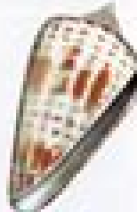
Alphabet Cone (CB)

Cerithium californicum To 1.8 in. (4.5 cm) Spiral high-spired shell is common on intertidal flats in estuaries and bays. Can climb trees and be out of water for extended periods.