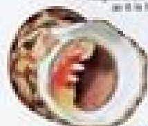
Bleeding Tooth (CB)

Hydrobia ulitiformis To 1 in. (2 cm) Brown to white shell has body seal frills and spines. Species found in shallow waters have smoother shells. Found in intertidal waters.