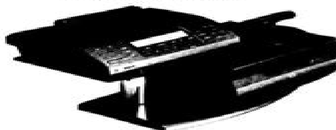
Black and Silver models