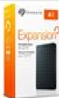
Seagate Expansion 4TB