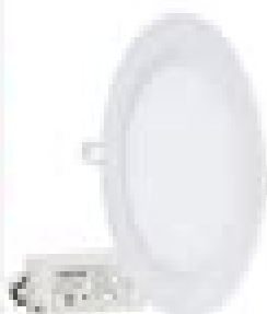
8" Round LED Panel Light