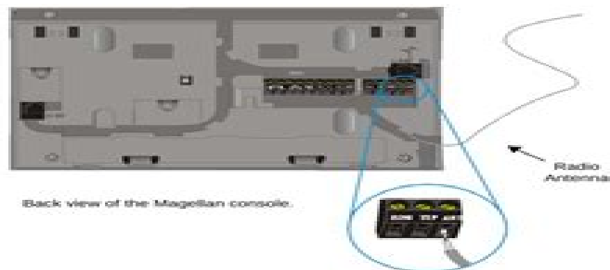
Back view of the Magellan console.