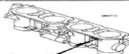
© 2004 Blackwell Publishing Ltd, Journal of Internal Medicine 255: 111–118