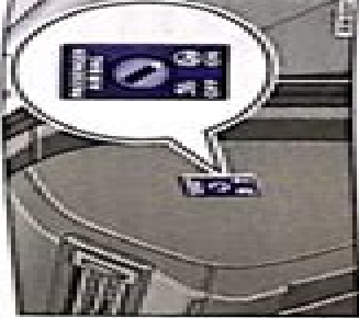
Fig. 17 In the dash panel on the front passenger side, key-operated switch for switching the front passenger front airbag on and off.

ⓘ Please refer to A at the start of the chapter on page 18.