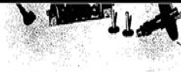
FIG. 8 — CAMSHAFT AND VALVE LIFTER REMOVED

8, rotate crankshaft to olve lifters and camshaft. as shown in Fig. 9.