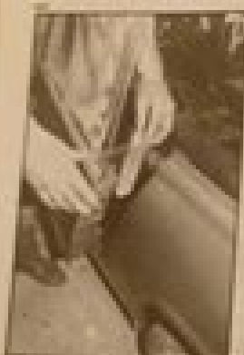
Work on the suspension system is done in the engine bay. The car is on the left.