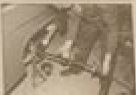
Work on the suspension system is done in the engine bay. The car is on the left.