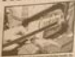
Work on the suspension system is done in the engine bay. The car is on the left.