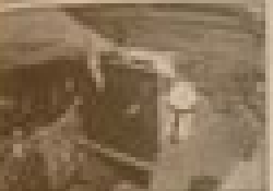
Work on the suspension system is done in the engine bay. The car is on the left.