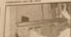
Work on the suspension system is done in the engine bay. The car is on the left.