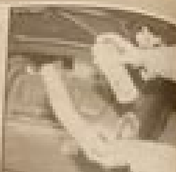
Work on the suspension system is done in the engine bay. The car is on the left.