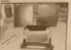
Work on the suspension system is done in the engine bay. The car is on the left.