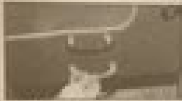
Work on the suspension system is done in the engine bay. The car is on the left.