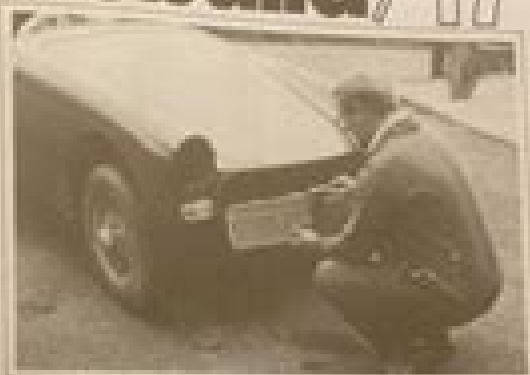
Work on the suspension system is done in the engine bay. The car is on the left.