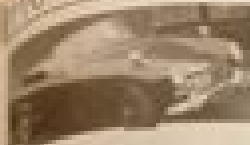
Work on the suspension system is done in the engine bay. The car is on the left.