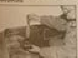
Work on the suspension system is done in the engine bay. The car is on the left.