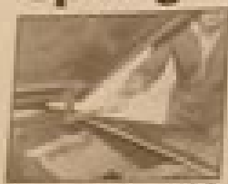
Work on the suspension system is done in the engine bay. The car is on the left.