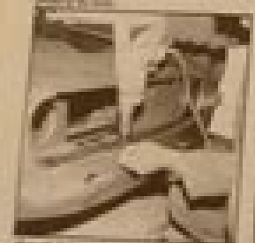
Work on the suspension system is done in the engine bay. The car is on the left.