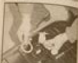
Work on the suspension system is done in the engine bay. The car is on the left.