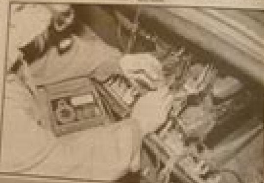
Work on the suspension system is done in the engine bay. The car is on the left.