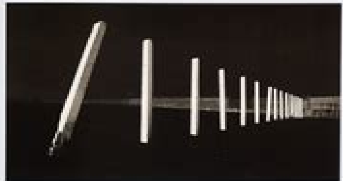
House of the Future (Chicago, 1954)