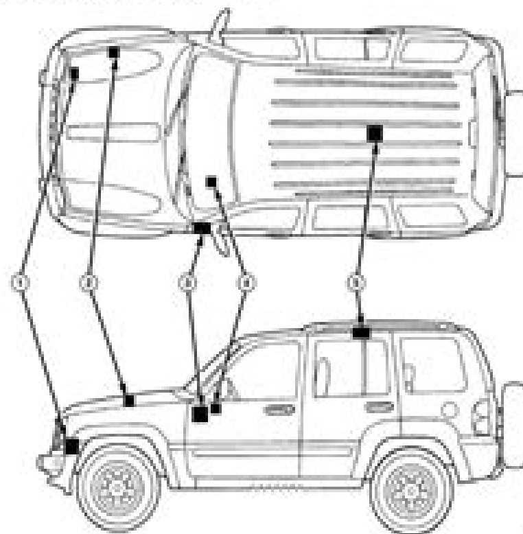
Fig. 2 Vehicle Theft Security System