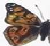
Dama Patagónica Patagonian Lady Vanessa atalanta 6 cm