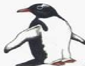
Pingüino Pico Rojo Chinstrap Penguin Pygoscelis adeliae / 40 cm