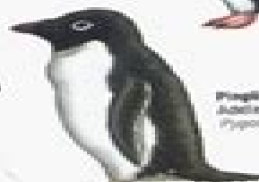
Pingüino de Adelia Adelia Penguin Pygoscelis adeliae / 40 cm