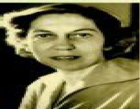
EDDORA WELTY • MARGARET MITCHELL • ZORA NEALE HURSTON