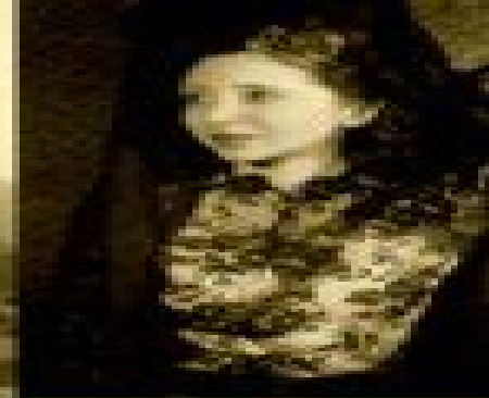
MAE WEST • GERTRUDE STEIN • ANAIS NIN