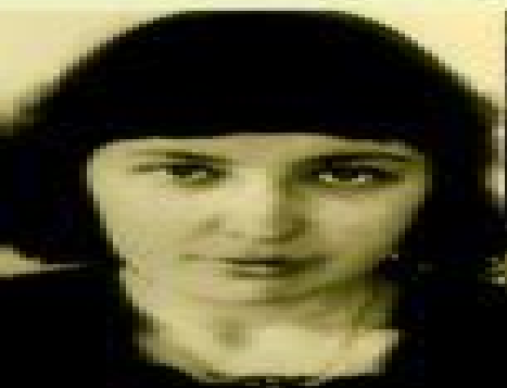
MARINA TSVETAYVA • HANNAH ARENDT & MARY MCCARTHY • DORIS LESSING