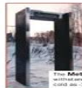
The Meteor 200 WP can withstand temperatures as cold as -30 °C (-22 °F) with optional heater.