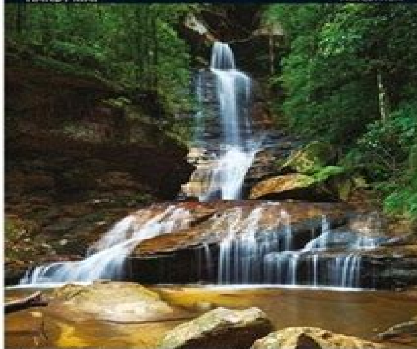
CAMPBELL FALLS IN THE BLUE MOUNTAINS NATIONAL PARK (TOP) Enderbush, Australia, Winter

Camping/Rest areas 24-hr fuel National parks Fully indexed