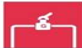
Gas Shutoff Valve