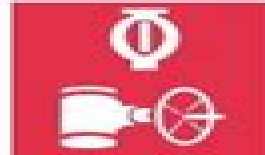
Automatic Sprinkler Control Valve