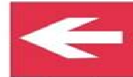
Directional Arrow *