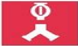
Fire Department Automatic Sprinkler Connection — Siamese