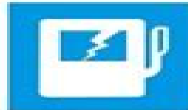
Electric Panel or Electric Shutoff