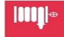
Fire-Fighting Hose or Standpipe Outlet