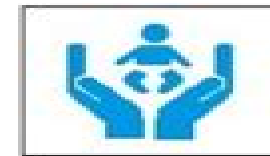
Child Care Center