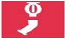
Fire Department Automatic Sprinkler Connection — Single