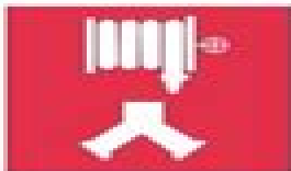
Fire Department Standpipe Connection