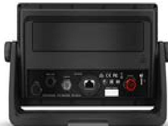
Rear of Modern MFD with NMEA 2000