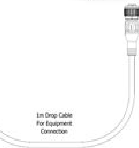
1m Drop-Cable For Equipment Connection