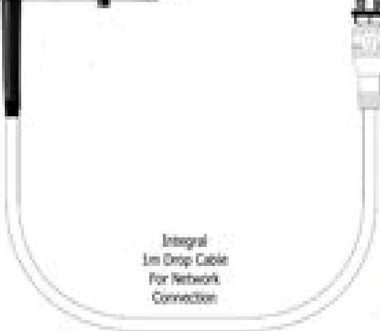
Integral 1m Drop Cable For Network Connection