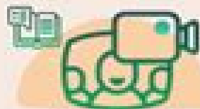
Online Instructions and Orientations