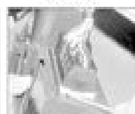
4.6c ... undo the heater retaining screws using sockets from the panel ...