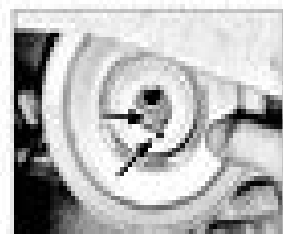
4.5 Refit the crankshaft pulley aligning the cut-out with the raised notch on the crankshaft sprocket (arrowed)