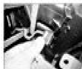
4.5a ... undo the heater retaining screws using sockets from the panel ...

7 Remove the light switch located on the