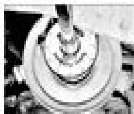
4.6 Fit the new retaining bolt and tighten it as described in the text