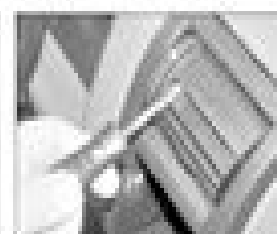
4.6b ... undo the heater retaining screws using sockets from the panel ...