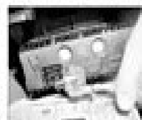
4.6a ... undo the heater retaining screws using sockets from the panel ...

rear of the rear of the face with reference to Chapter 10, Section 5, then undo the screws and remove the side and end panel around from the face. The screws are removed by pressing down the end panel to allow the