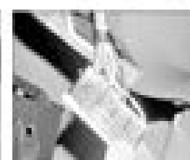
4.7b ... undo the heater retaining screws using sockets from the panel ...