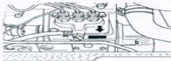
Fig. 1—Engine serial number location on all models.

Engine serial number is stamped on right, front side of cylinder block (Fig. 1) on all models. Tractor chassis serial number is located at front of range transmission housing (Fig. 2A) on Models MT300 and MT300D. On all other models, chassis serial number is located on right side of transmission housing (Fig. 2).