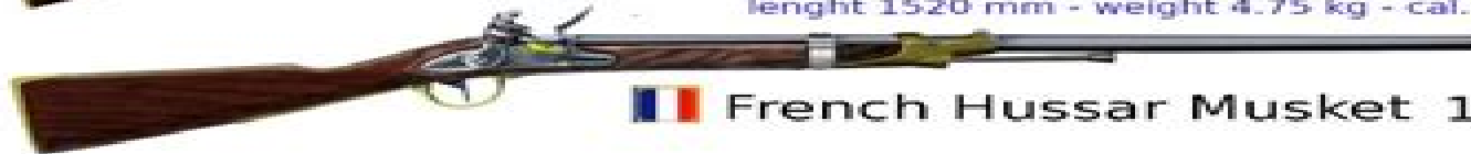
French Hussar Musket 1786

length 1520 mm - weight 4.75 kg - cal. 17.5 mm