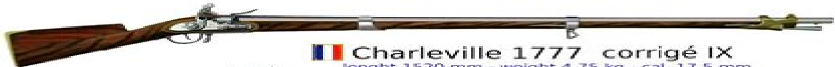
Charleville 1777 corrigé IX

length 1458 mm - weight 5 kg - cal 17.8 mm