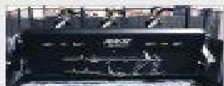
MULTIPLE ROBOT CONTROL