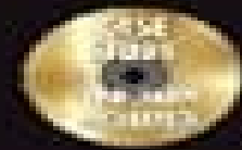
Image shown is of the core product; image of product received may appear differently.