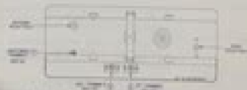
Figure 1: Schematic diagram of the experimental setup. A subject is seated at a table, viewing a video screen. A camera is positioned above the screen. A target is placed on the table. A ruler is used to measure the distance from the subject's hand to the target. The distance is labeled as 10 cm. The target is labeled as 'Target'.