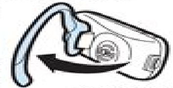
1 Open Earhook