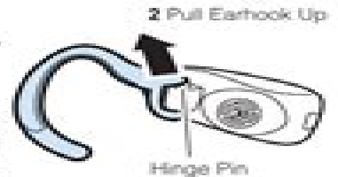
2 Pull Earhook Up