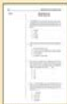
Sample Exams with Answer Keys Develop testing skills