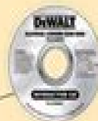
Interactive CD Contains practice exams with pop-up reference features

Our exam and certification preparation books are the perfect resource to help beginners or seasoned pros prepare for and pass licensing and certification exams across all states.