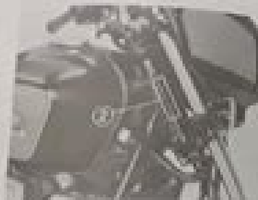
(2) Frame number

The VIN, Vehicle Identification Number (1), is on the Safety Certification Label affixed to the left side of the steering head. The frame number (2) is stamped on the right side of the steering head.