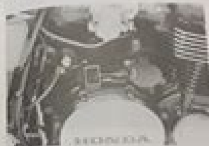
(3) Engine number

The engine number (3) is stamped on top of the crankcase.