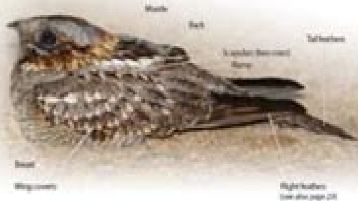
Red-necked Nightjar Caprimulgus vociferus