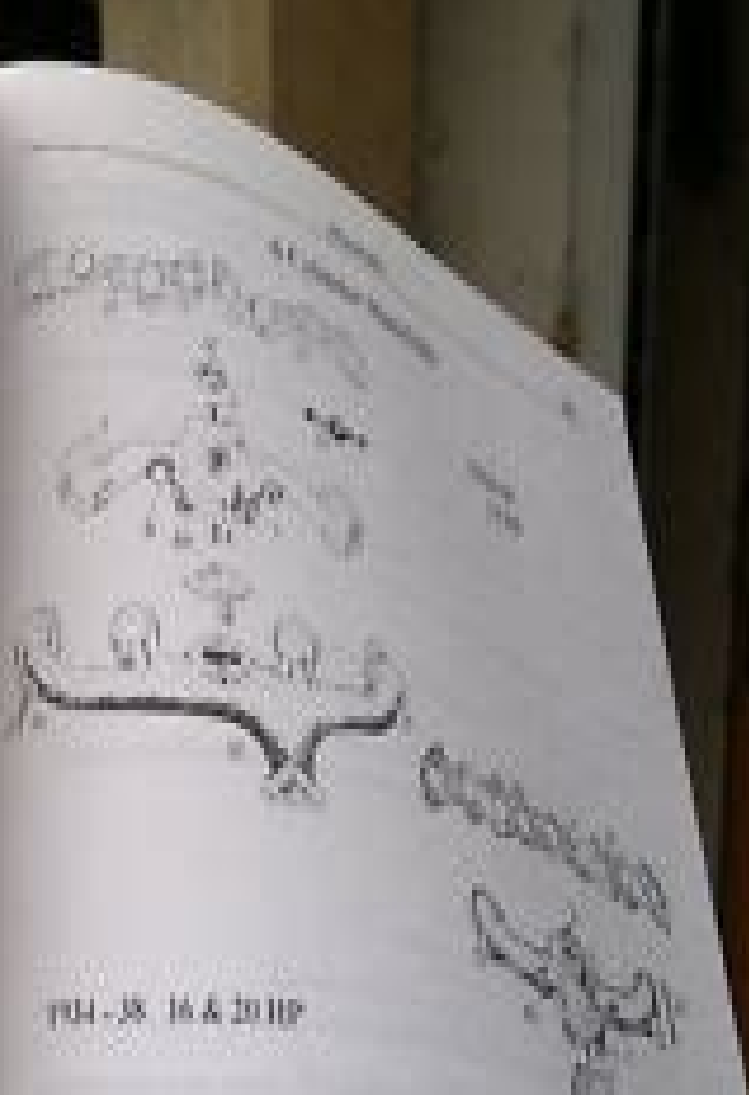
FIG. 5 18 & 20 HP