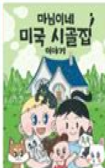
마님어네 미국 시골집 이야기 마님