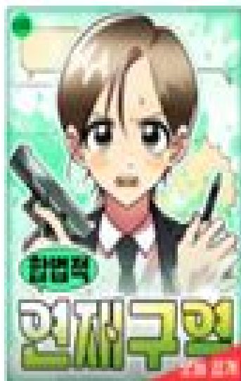
합법적 연재 구역 한글판