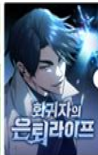
화귀자의 은퇴라이프 서희 / HNS / 전희정