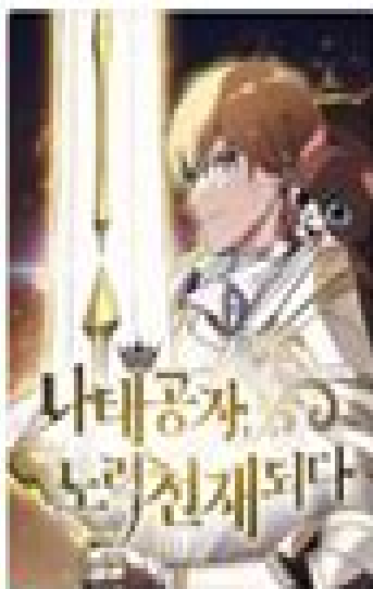
나태공자, 노력 천재되다 doh / 도도본 / 이동철