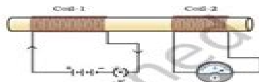
Figure 13.17 Current is induced in coil-2 when current in coil-1 is changed

In this activity we observe that as soon as the current in coil-1 reaches either a steady value or zero, the galvanometer in coil-2 shows no deflection.