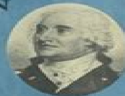
Charles C. Pinckney

A CRITICAL ANALYSIS OF "AN ECONOMIC INTERPRETATION OF THE CONSTITUTION"