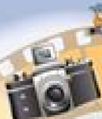
1925 - The first 1/2 image line reflect camera (Leica). This camera used a single lens, a mirror and a prism system which allowed the photographer to see exactly what would be seen by the camera.