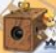
1888 - Kodak made the first film camera, which had a 10-foot film roll that held 100 photos. The made photography available to all! These photographs were 1.3 inches.