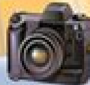
1995 - Nikon offered the first 35mm digital single lens reflex camera, which combined a digital imaging sensor with the mechanisms and optics of a single lens reflex camera.