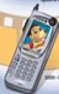
2000 - First camera phone is produced in Japan