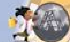
1839 - The first glass negative was used in Daguerre's process which needed exposure to make a negative and then printing it onto a separate plate to develop and fix the image. These plates were one of a kind and took only 15 minutes to take the photo.