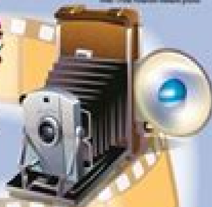
1925 - First 35mm reflex photo